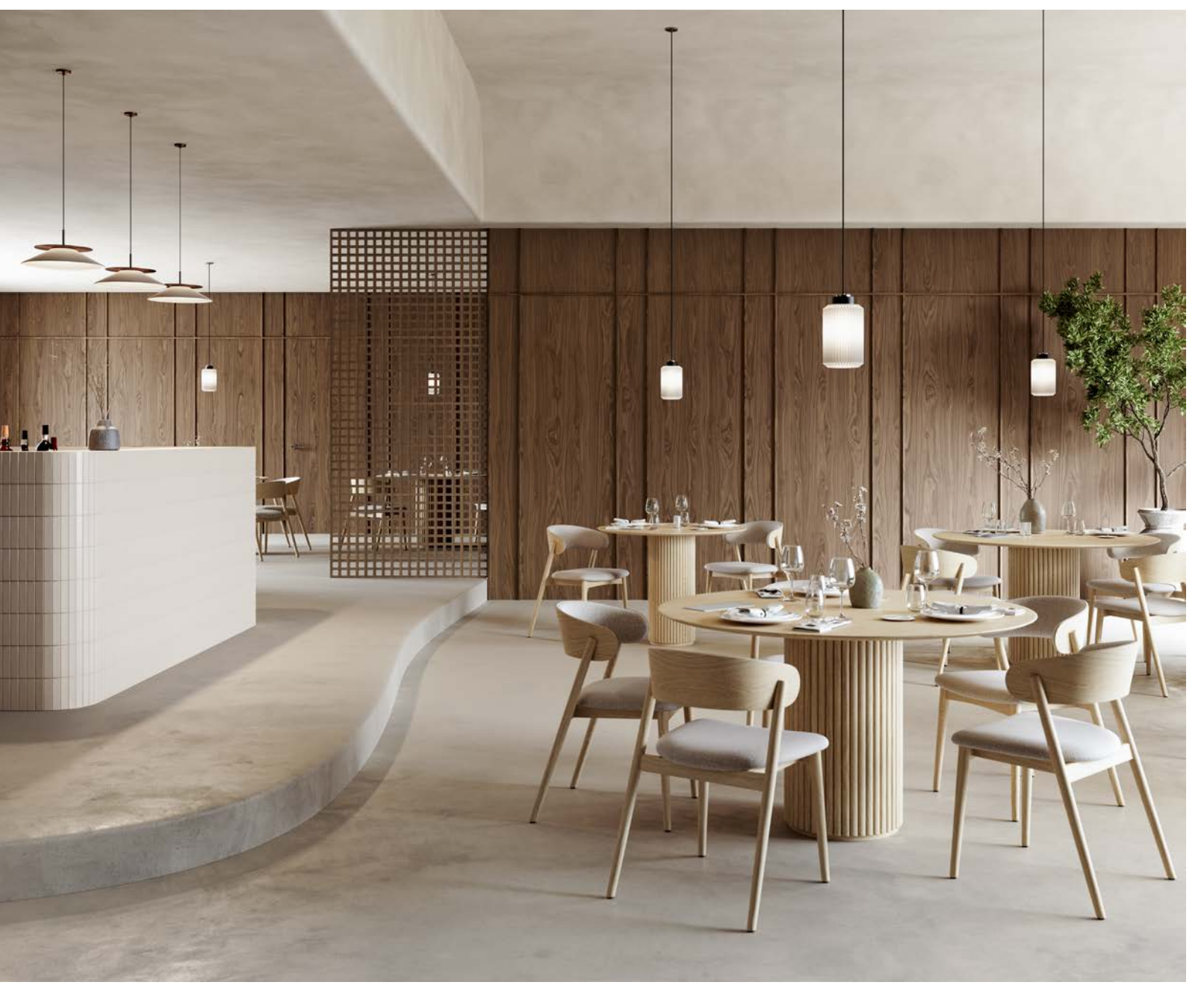
Finish: transparent varnish

Scan the QR code to discover multiple panels.