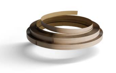
Veneer 24 or 48 mm x 100 m (15/16" or 1-7/8" x 328 ft)