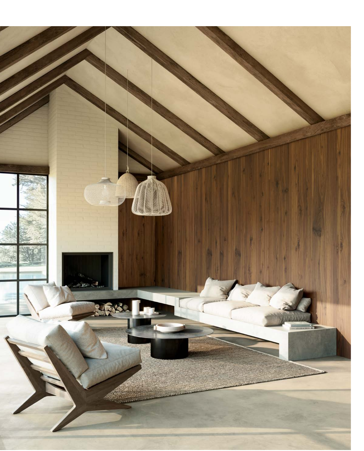
Finish: transparent varnish