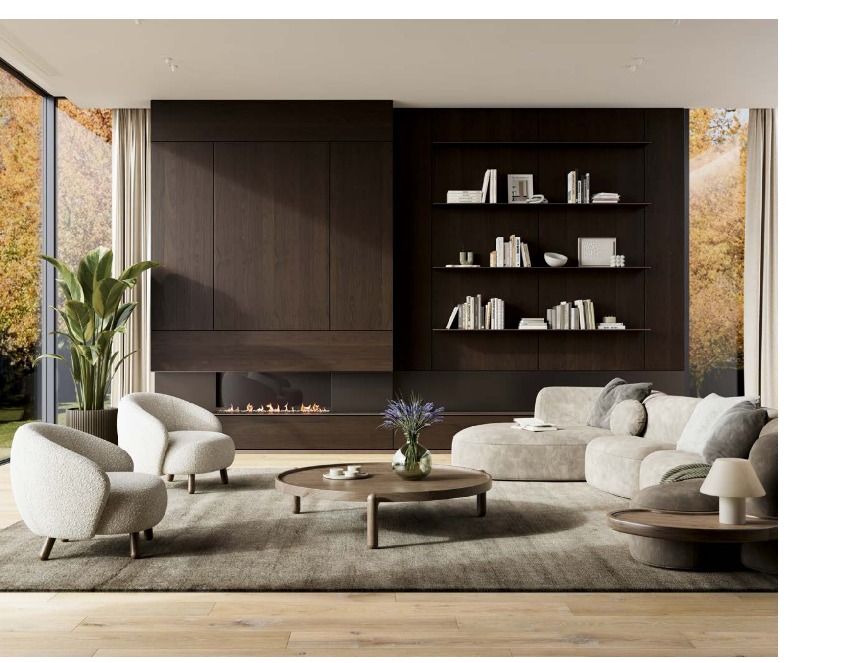
Finish: transparent varnish