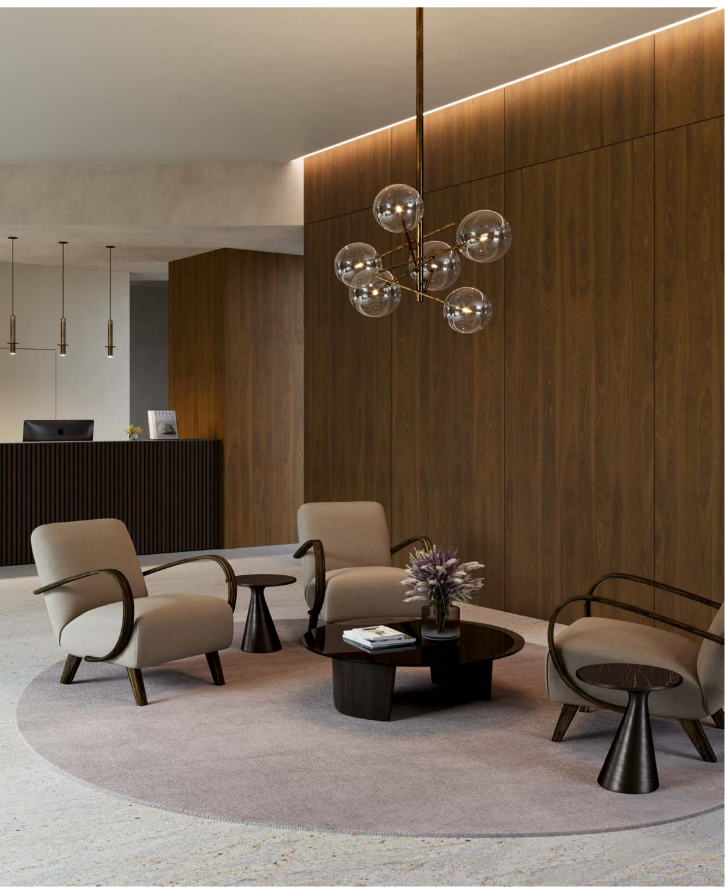
Finish: transparent varnish