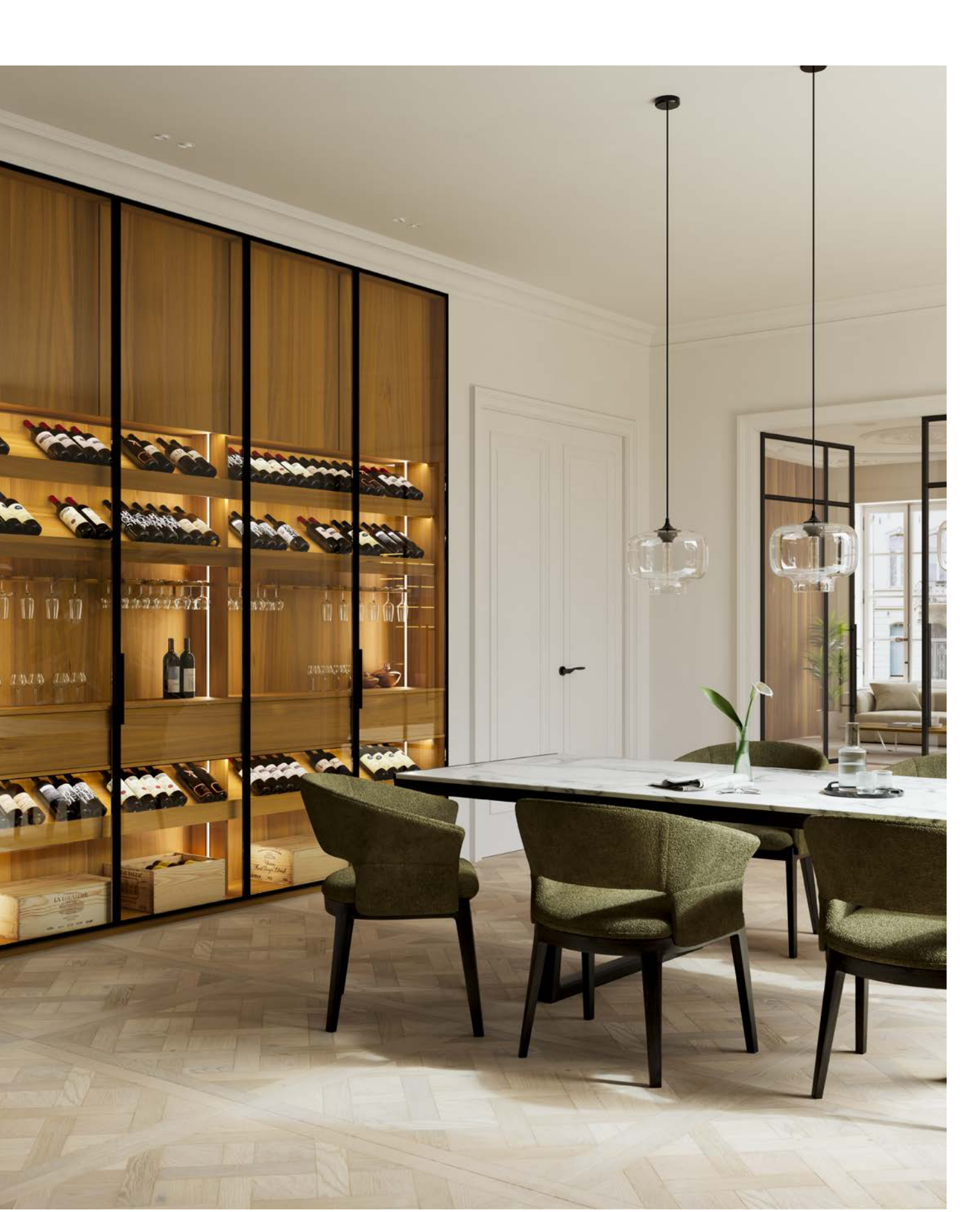
Finish: transparent varnish