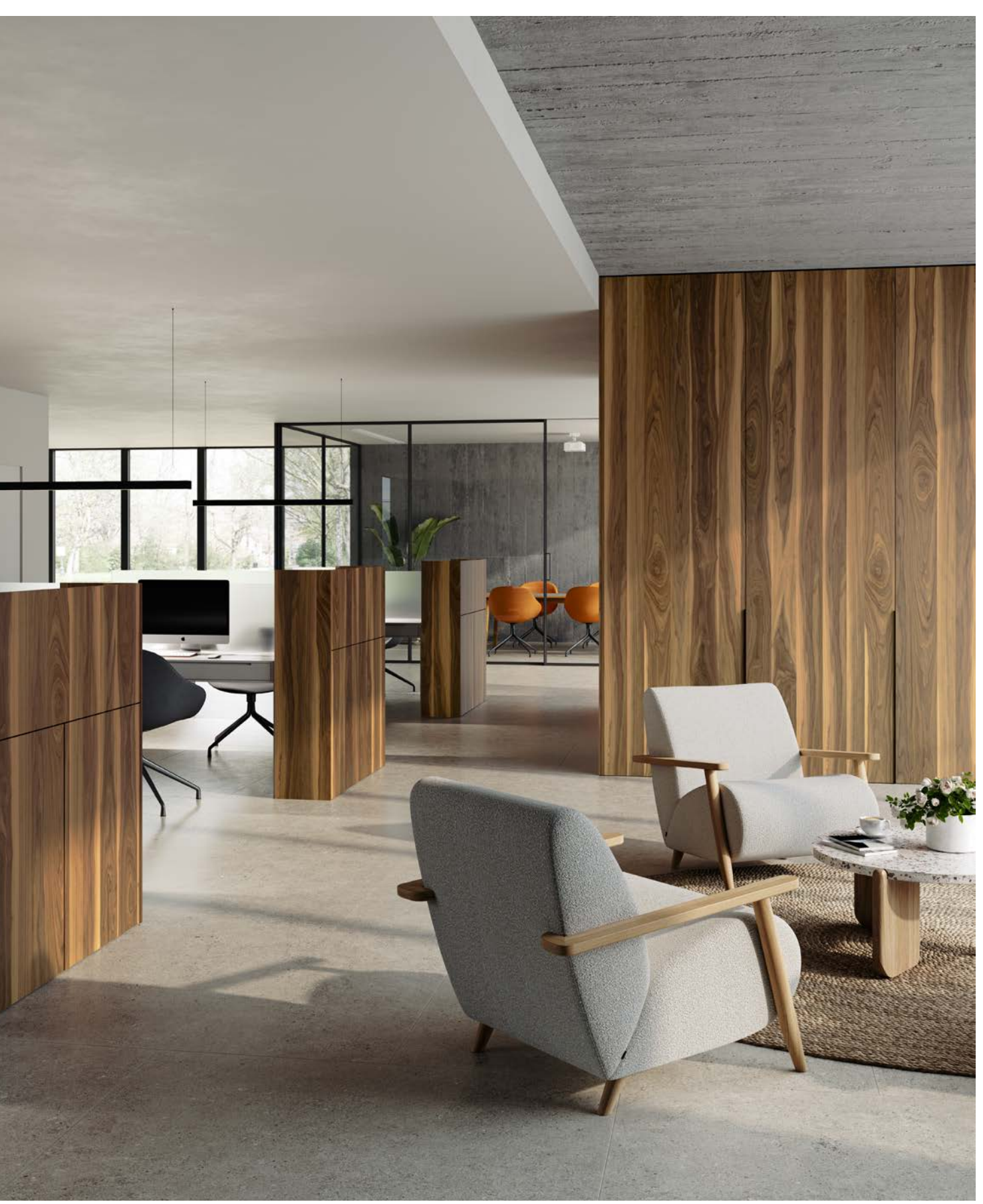
Finish: transparent varnish