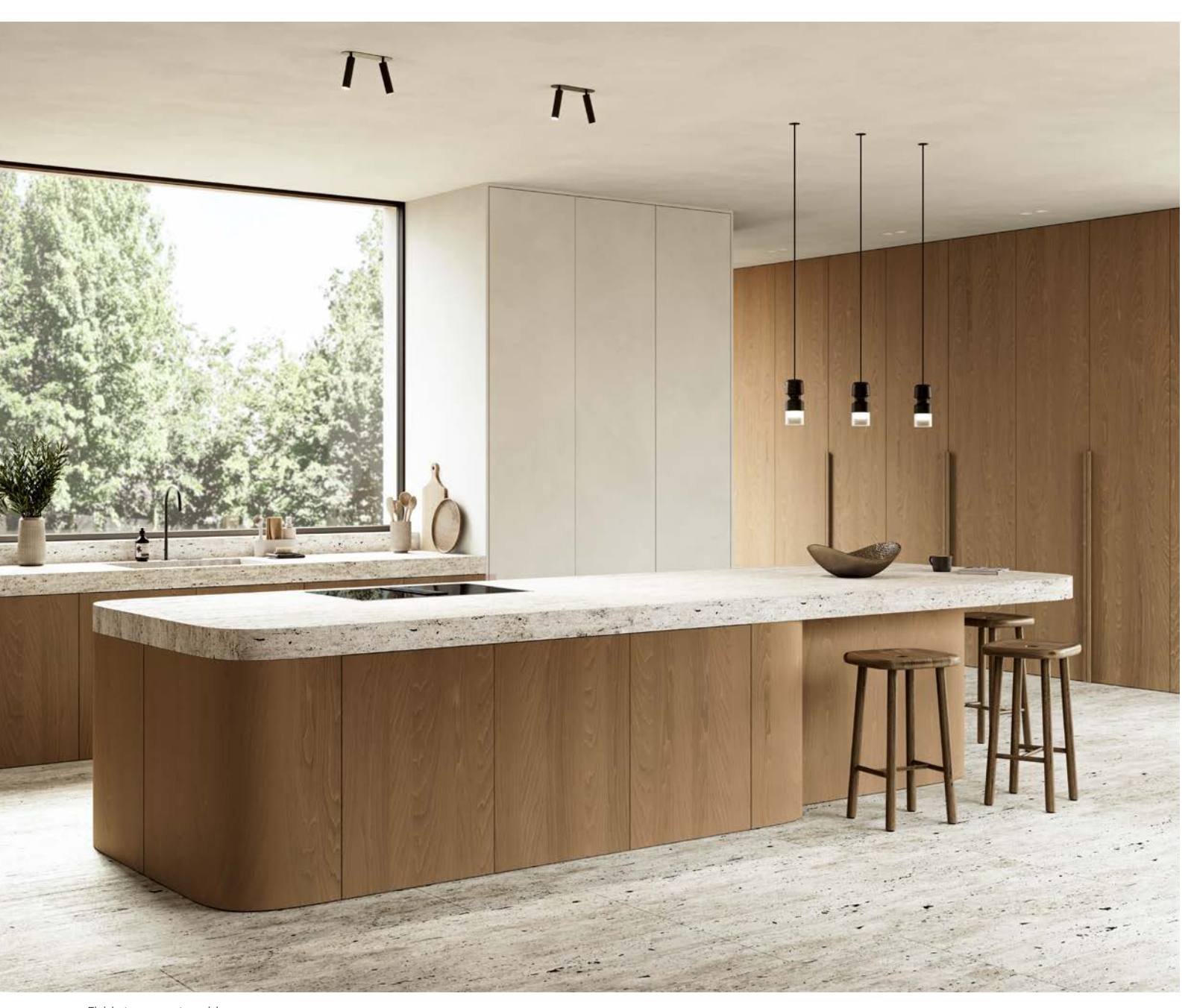
Finish: transparent varnish