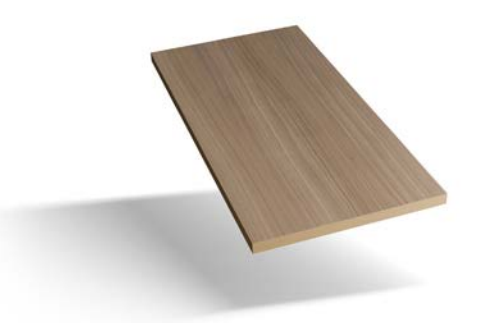
2500 x 1240 x 19 mm (8' x 4' x 3/4") 3050 x 1220 x 19 mm (10' x 4' x 3/4")