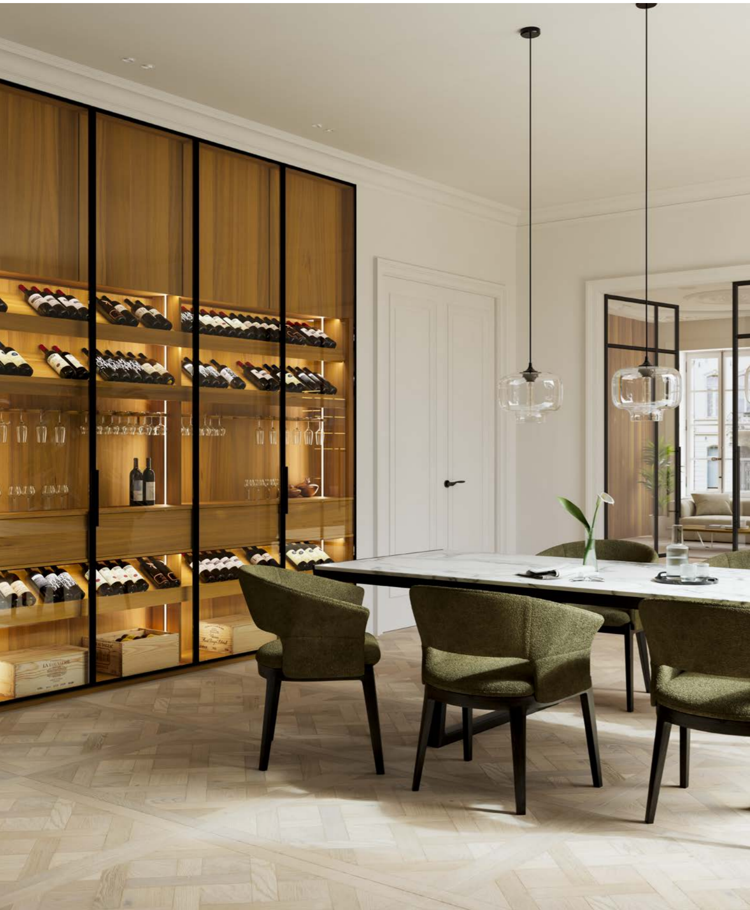
Finish: transparent varnish