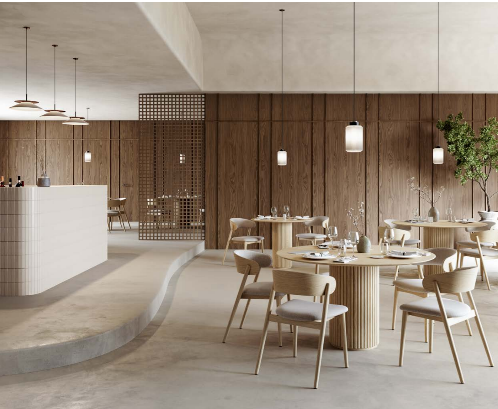
Finish: transparent varnish