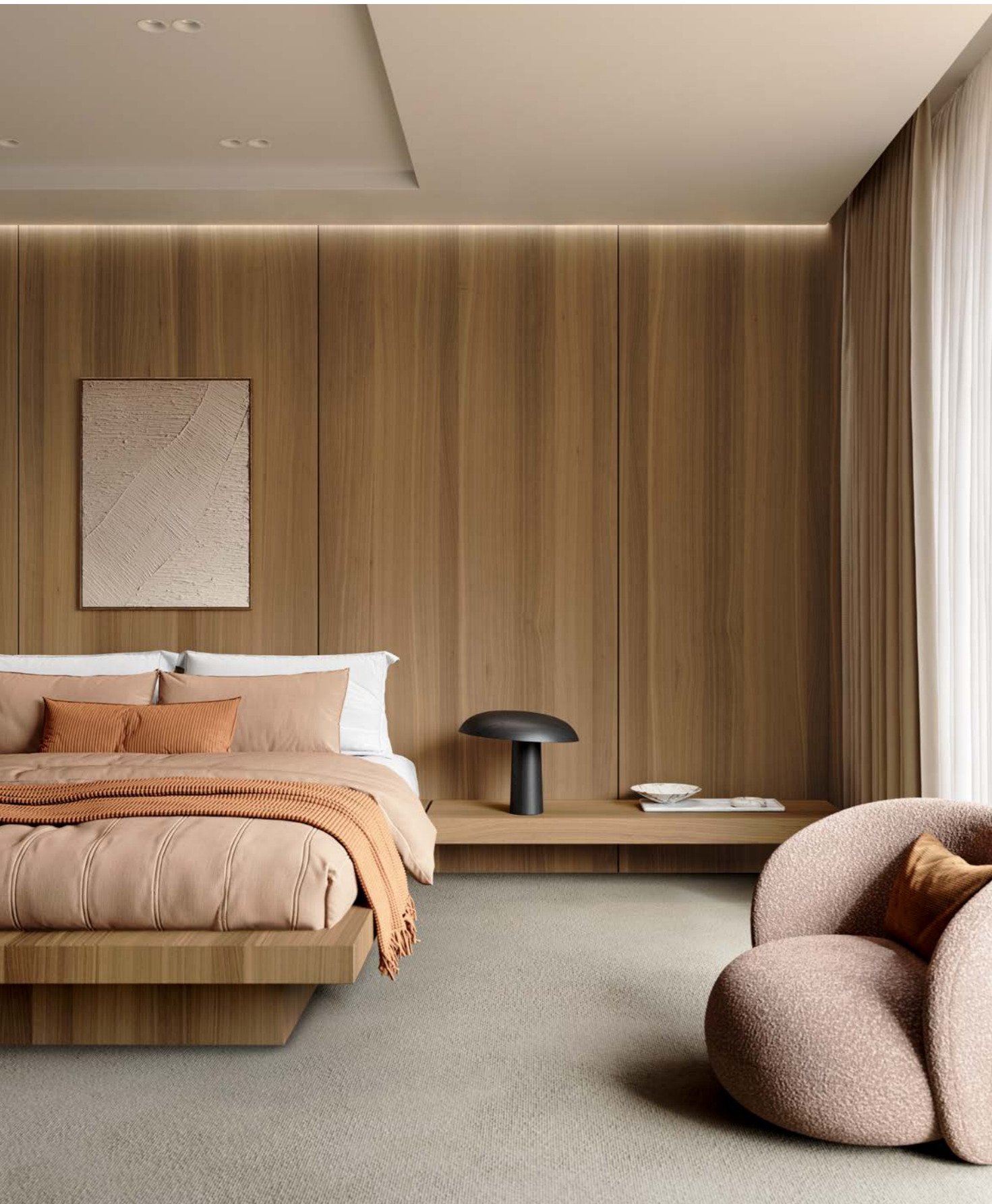
Finish: transparent varnish