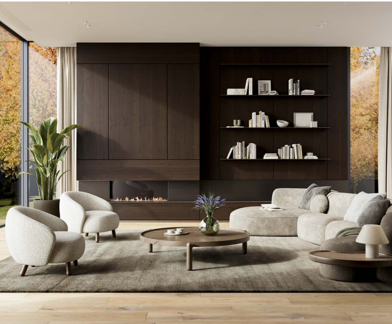
Finish: transparent varnish